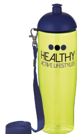
Bottle Collar & Lanyard